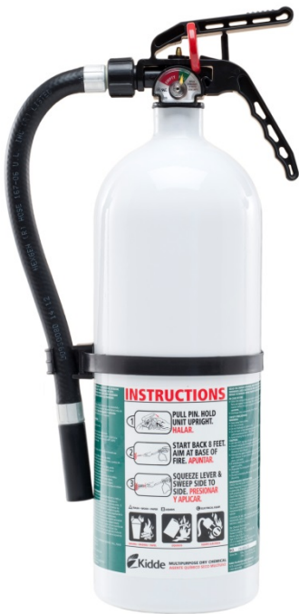
Kidde Disposable Fire Extinguisher with plastic valve