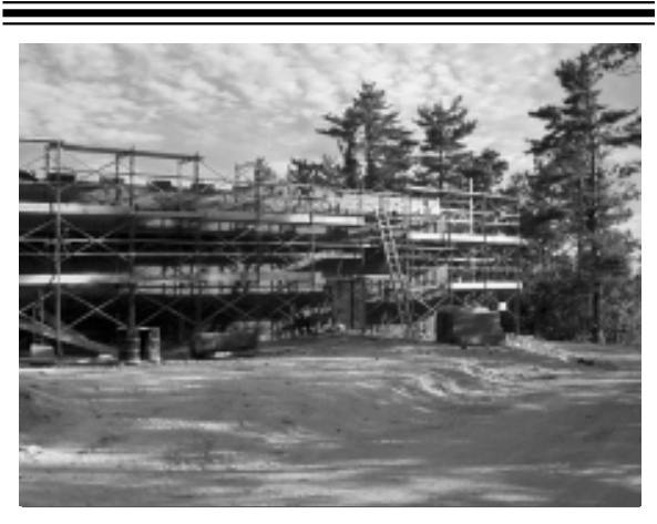
The New Raymond Elementary School As Of July 21, 1999

PROP Food Distribution by Raymond Food Pantry at Raymond Town Hall will be Tuesdays from 4:00 PM to 6:00 PM and Fridays from 10:00 AM to 12:00 noon.