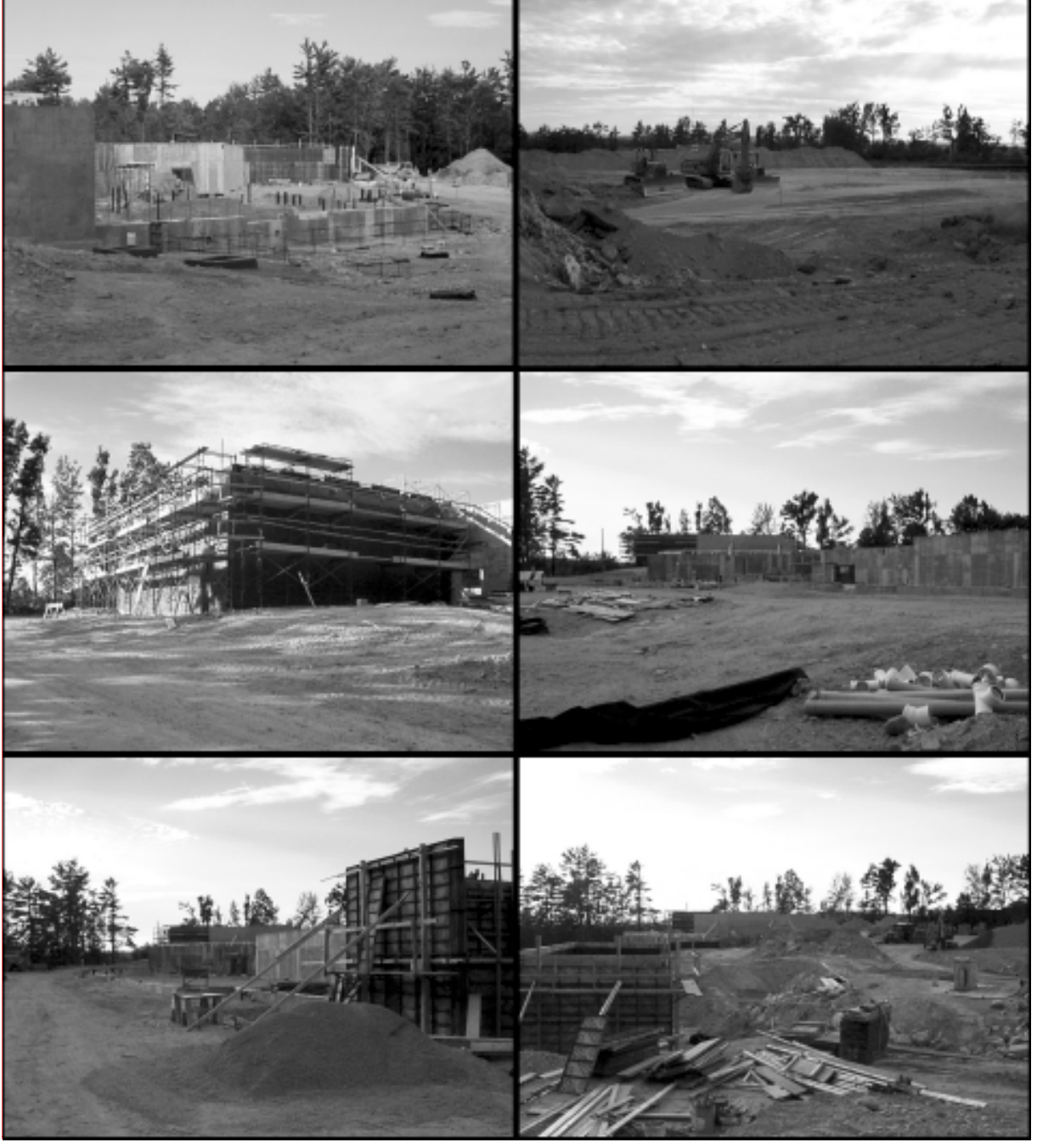
The New Raymond Elementary School As Of July 21, 1999