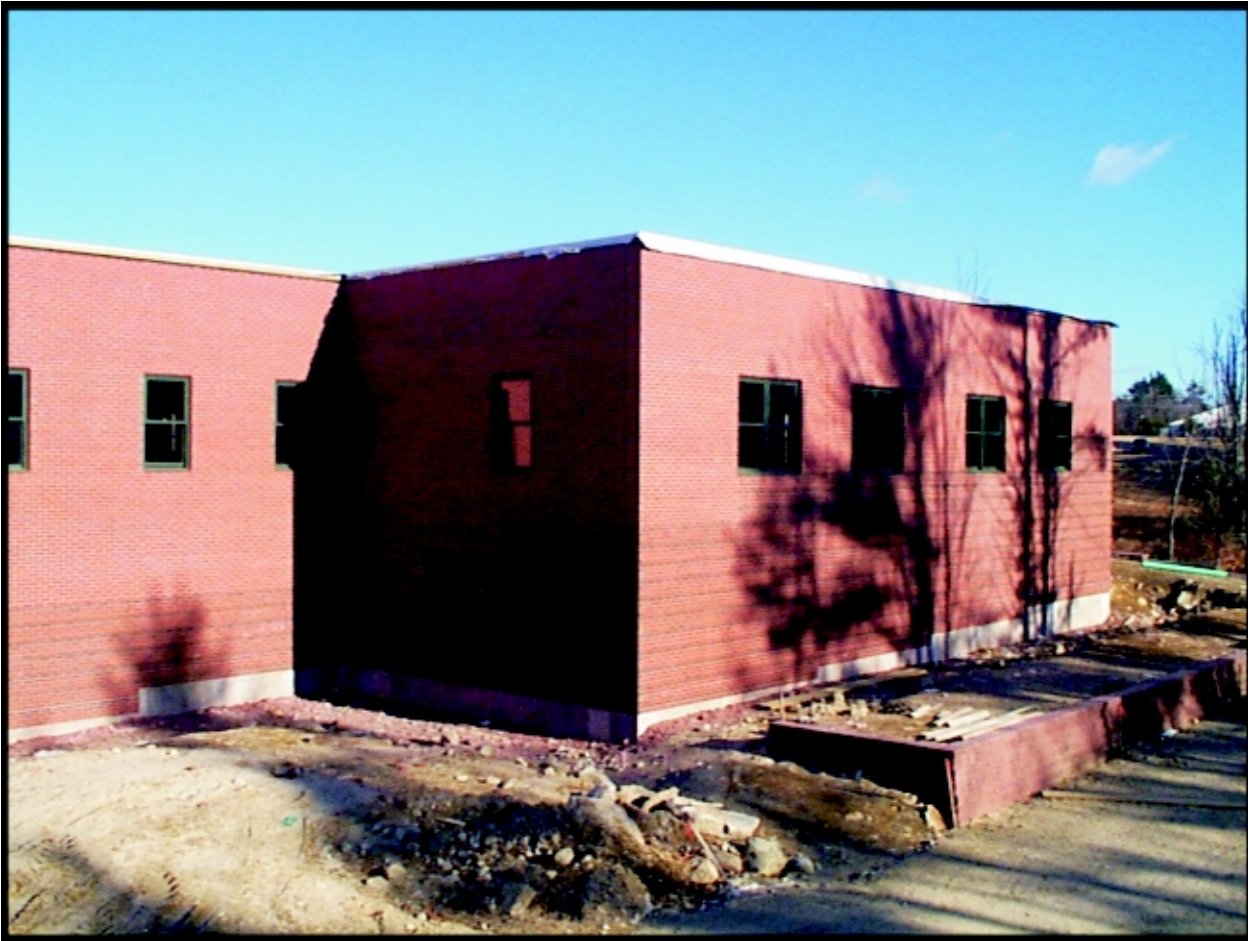
Bricks and windows are the finishing touches on the exterior of the Kindergarten wing.