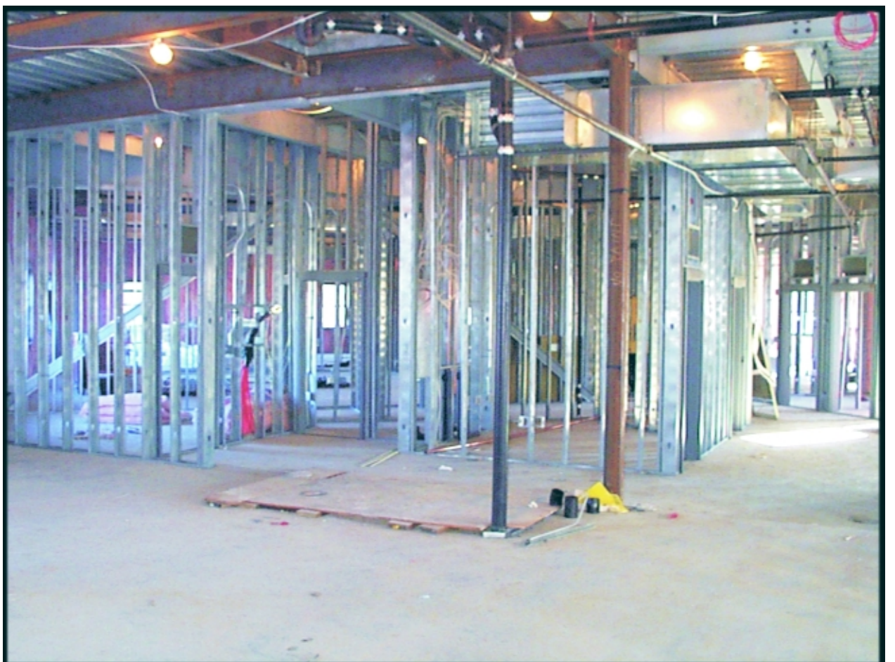
Metal studs, plumbing, and wiring on the first floor at the new school.