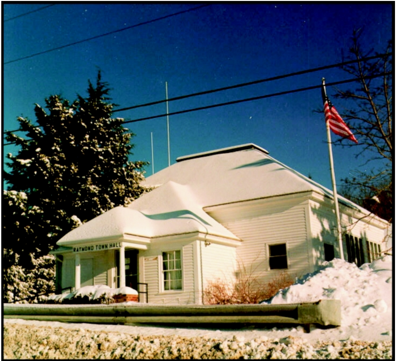
Wishful Thinking Or Good Fortune?