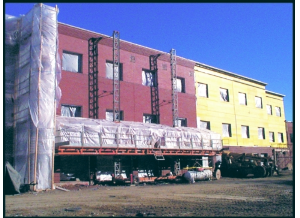
The new Raymond Elementary School gets its brick facing.

In closing, I would like to wish all Raymond families only the very best in the New Year. Thank you for your continuing support of education in our community. It is always much appreciated and valued.