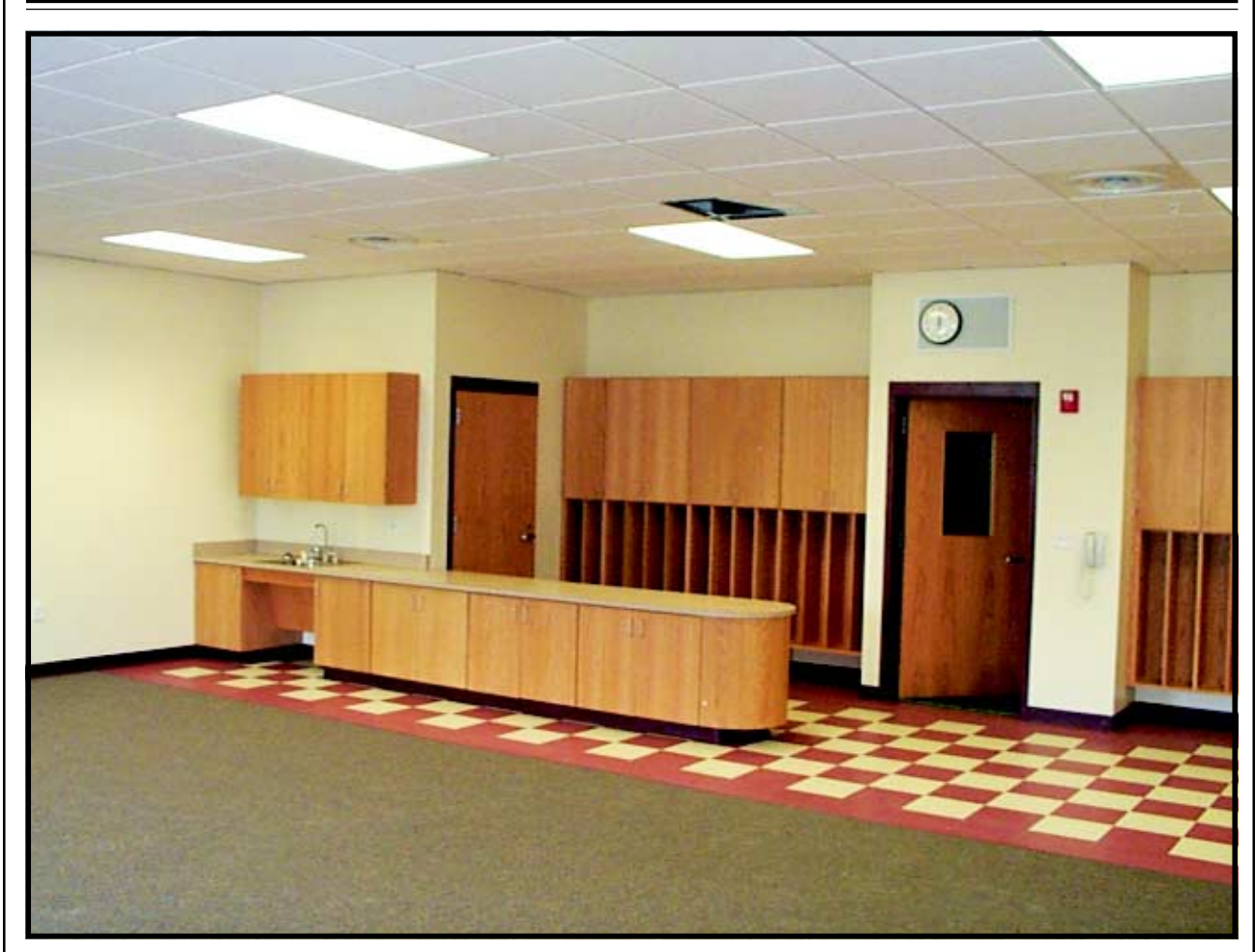
Inside a Kindergarten classroom in the new Raymond Elementary School

Detailed information to follow in the September edition of the Road Runner.