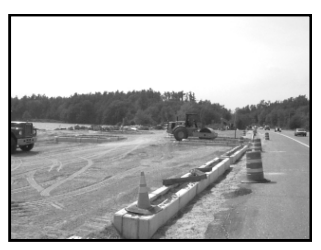
Raymond Beach Area Under Construction

At this time the contractor, Department of Inland Fisheries and Wildlife and the Town are unsure when the facility will be opened to the public. It is possible that the Beach portion of the facility will not be open during the 2000 summer season. Please continue to read the Road Runner each month for up to date information or visit the Raymond Web Site at http://www.raymondmaine.org. As always, you may call the Town Office at 655-4742 for more information.