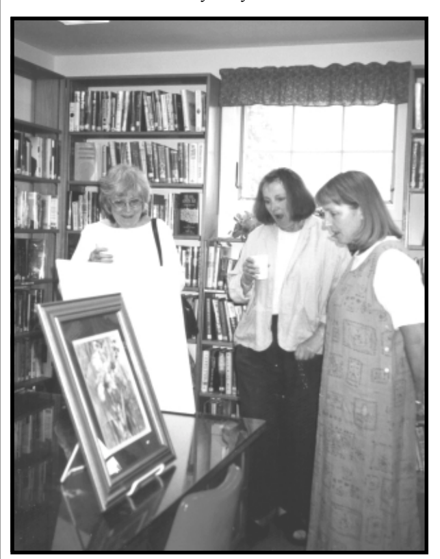
Library patrons admire artwork, which will be available at the Silent Auction at Jordan-Small School on July 8<sup>th</sup>.

These paintings are now on exhibit at the library until the Fair on July 8. If you are unable to attend the Fair, but would like to bid on any one of the pictures, there are bid sheets at the library for your convenience.