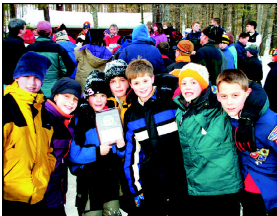
Raymond Cub Scout Pack 800, Wolverine Patrol won the Webelos Division of the Klondike Derby