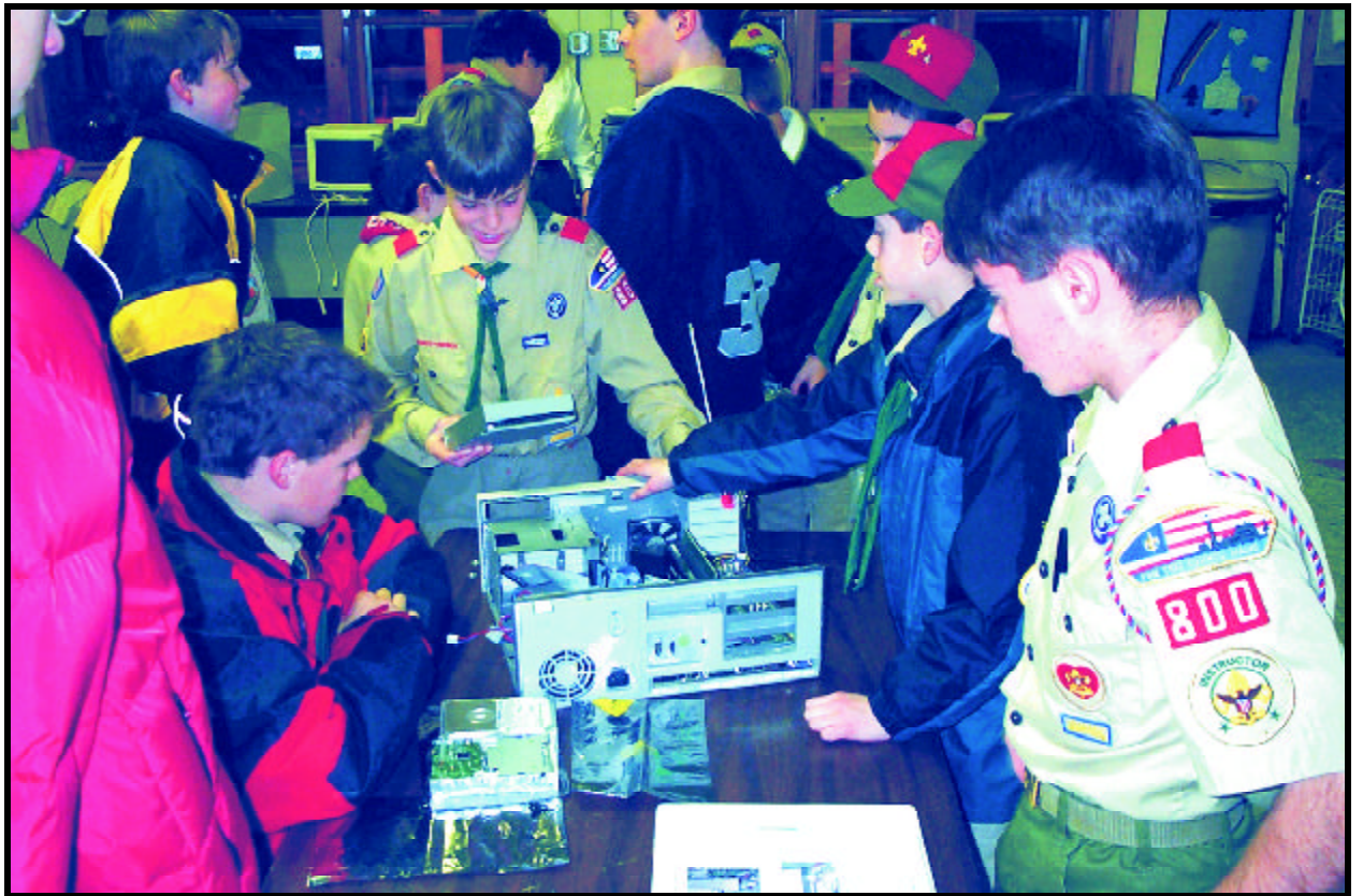
Believe it or not, all four computers worked after being completely taken apart and reassembled

The third meeting was the Court of Honor. Scouts sang