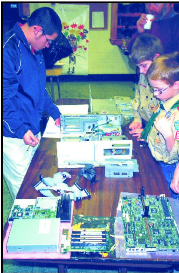
The Predator patrol starts to reassemble their computer

To keep up to date on upcoming Troop 800 activities, check out the Troop's web pages on the Town's website at