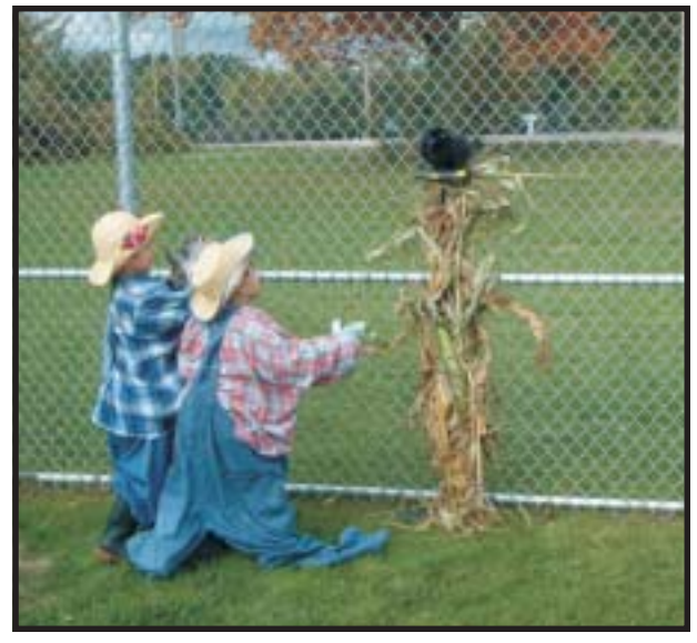
Students work together to "Stuff the Scarecrow".

It was wonderful to have several of the upper grade classes and Kindergarten "Book Buddies" come outside for a few minutes in their day to watch, cheer and share our outdoor learning fun. This is one example of how our Full Day