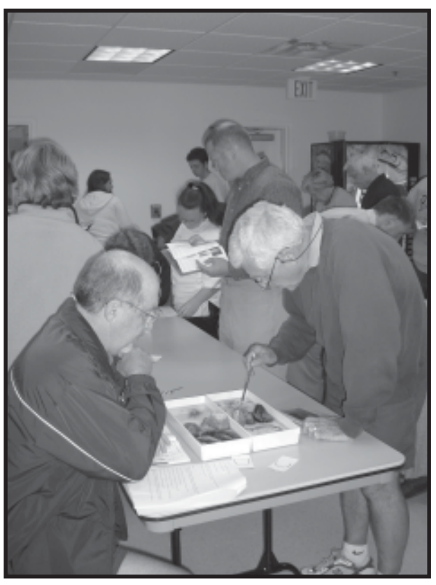
June 22nd Plant Identification Workshop

Cruising the Buffers - Saturday, August 7<sup>th</sup>, 9-11am Join friends and neighbors for a fun, educational boat ride around Thomas Pond. See the shoreline and learn how to enhance your property. Learn how to protect the lake while beautifying your property and increasing the value of your lot. This educational cruise is part of the Thomas Pond Conservation Project and will showcase many of the completed projects around the lake. One boat will leave from the Common Beach on Watkins Shore Road, and the other boat will leave from 79 Thomas Pond Terrace. To register call Betty Williams at the Cumberland County Soil and Water Conservation District at 856-2777 or e-mail betty-williams@me.nacdnet.org.