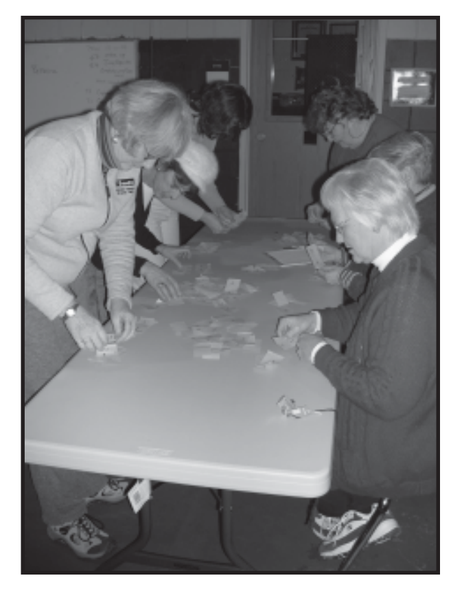
Ballot clerks at Tuesday's special town meeting in Raymond prepare to count ballots.

the process of incoru, 0ting the new comprehensive plan into existing town ordinances.