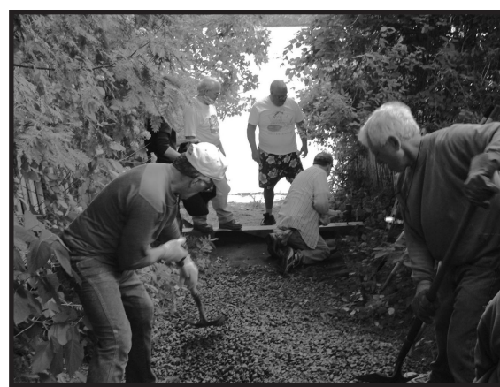
Workshop volunteers install water diverters and spread rocks to repair Maple Avenue right-of-way