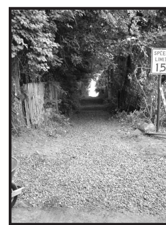
After: Rock-filled infiltration trench at top of ROW, waterbars and rock on path.