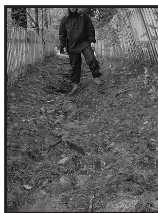
Before: Chronic erosion on ROW with exposed roots and gully.