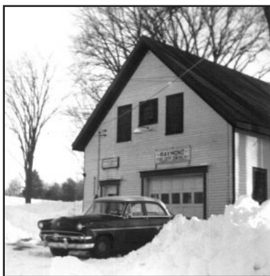
The "Town House" also served as school building in the firehouse.

The selectmen's Office was still on the second floor and for Town Meetings the fire engine was moved outside and chairs and benches set up for the people. With the consolidation of all elementary schools into a new