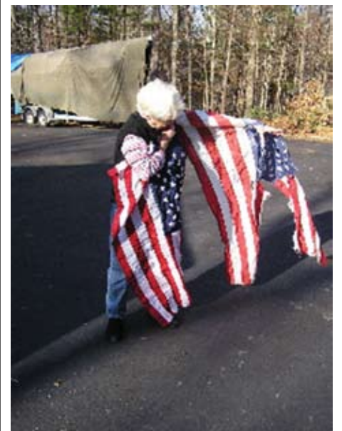
A new and a tired old flag.

For more information, call Eileen at 655-4193. Many thanks for your support!