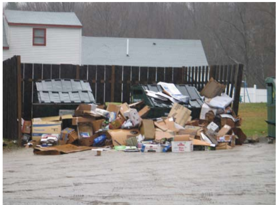
This is the view travelers are presented with as they pass the dumpsters on Webbs Mills Road.

A security camera will be installed to monitor use of the cardboard dumpsters. Residents who violate posted use regulations will be cited under Maine Law for littering. We hope that everyone will respect the area and help keep it neat and clean and save tax dollars.