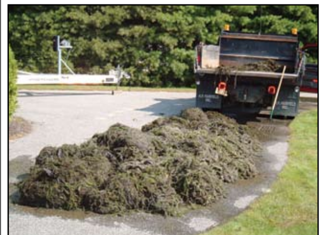
Milfoil pulled from Sebago Lake by divers.

More information on these events, including how to register, can be found in this issue of the Road Runner.