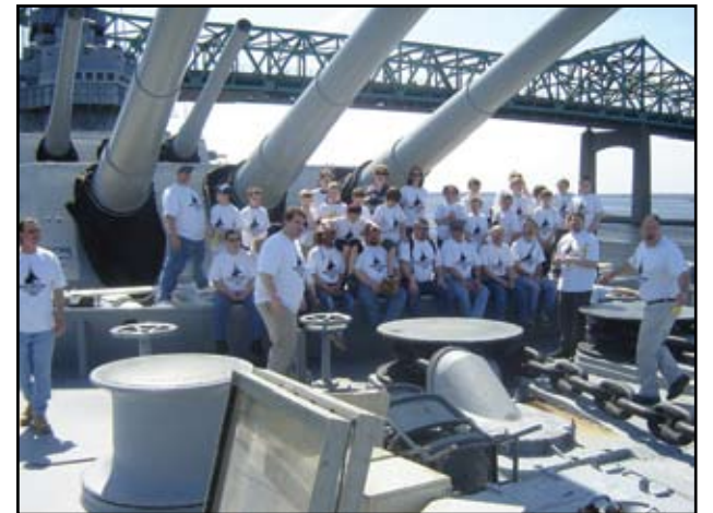
Battleship Mass was a great time. Check out all the pictures from our trip at www.raymondmainepack800.com