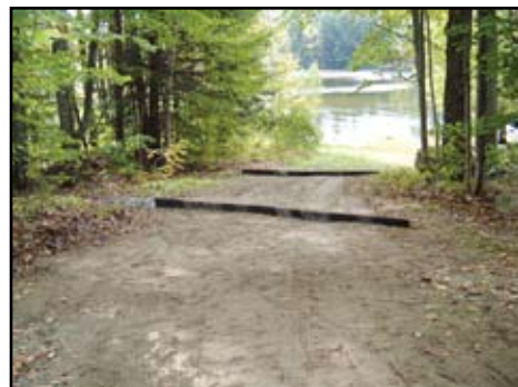
After: rubber blade diverters direct water into vegetation and away from the lake.