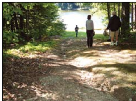
Before: eroded gully washing sediment into the lake.