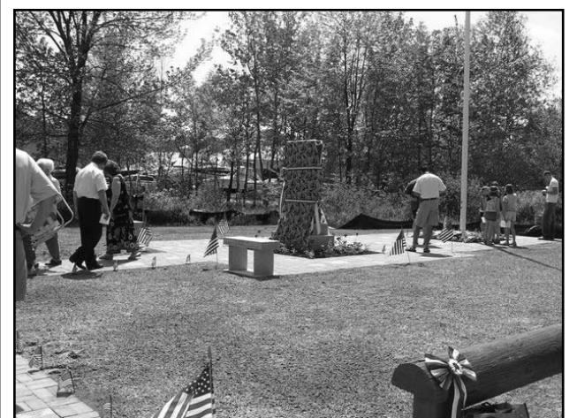
Additional photos of the Veterans' Memorial and the events on Memorial Day may be found on pages 9 and 12.