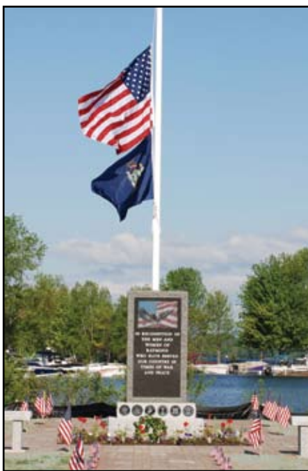
All decked out for Memorial Day.