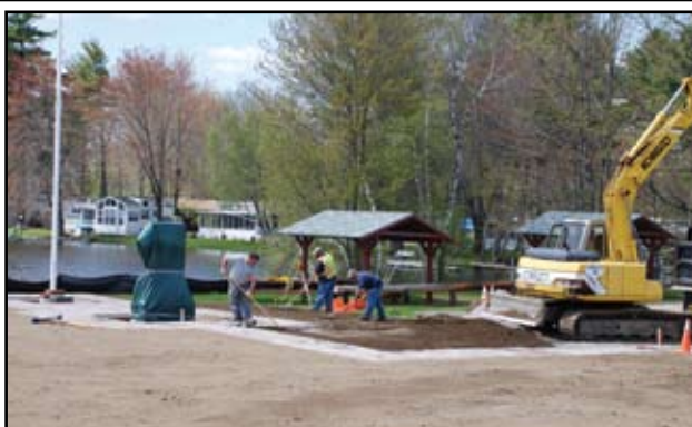
Raymond Public Works spreading loam