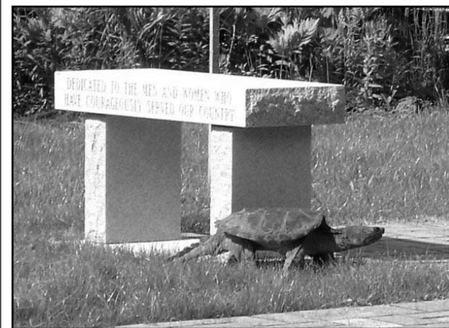
Another turtle visitor photo can be found on page 12.

Sharon says, “She made some holes in the grass, so she might have been laying eggs or trying to. It doesn’t really seem like a good place to lay eggs, but we probably shouldn’t disturb the holes, just in case.”