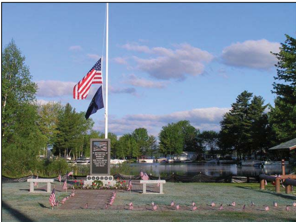
Photos taken on Dedication Day