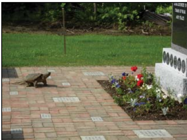
A visitor to the Veterans' Memorial