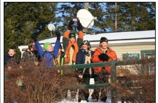
Congratulations, Raymond Cub Scout Pack 800.

The Klondike Derby was organized and run by the Boy Scouts of the Casco Bay Chapter of Madocawanda Lodge of the Order of the Arrow. The Point Sebago Resort donated the facilities for the day.