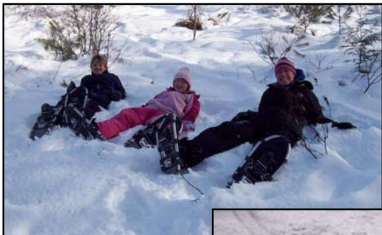
Middle school students snowshoeing and sledding (without the sled!)

Additionally, students in grades 3 through 8 are able to participate in our Saturday and vacation programs. Many of the programs involve a field trip, and this year we have visited: Landholm Land Trust for their fall festival, Macworth Island's fairy village, Pineland Farms and Casco for Maine Maple Weekend. The vacation program generally runs for 3 days and also includes some field trips, but we may just stay at school and have an International Food Festival, a game day or spend time outside sledding and snow-shoeing.