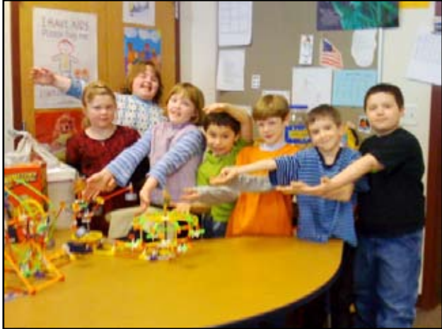
2nd and 3rd graders show off their carnival creation made from Kinex

At RES 27% of the students have registered for S.E.A.R.C.H. and participated in one or more of the programs. We offer language arts and/or math tutoring groups in grades 1 through 4 and numerous enrichment programs. Students were able to participate in gym activities, snowshoeing, violin lessons, art programs, cooking and crafts and Legos/Kinex to name a few.